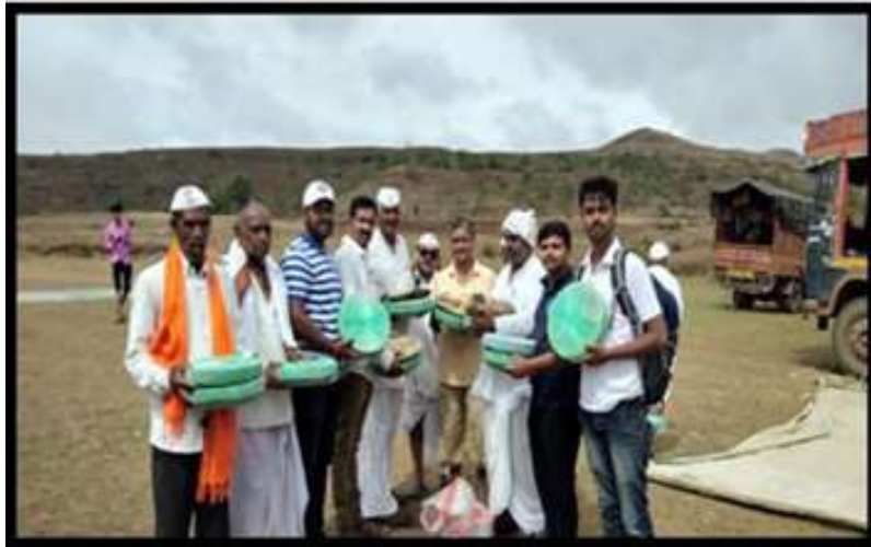
Clean Wari - Cleaning of Saswad premises, distribution of free leaflets and collection of Ushtavali and Nirmalya (Dated June 28, 29, 30, 2019)