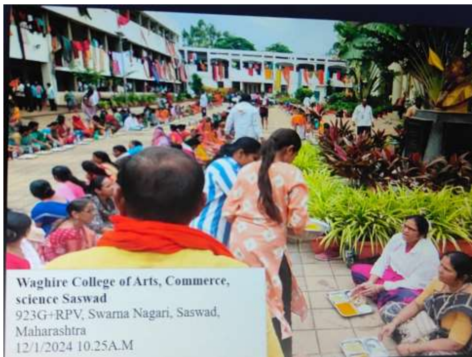
Title of the practice: Clean Wari - Healthy Wari - Nirmal Wari - Green Wari (Pilgrimage) (July 2 nd and 3 rd July 2024)