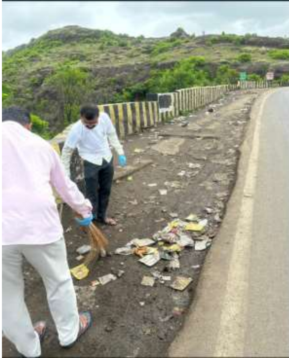
Cleaning activity carried out after the Wari

Notes (optional): It is a large event with many duties, as well as a traditional, religious aspect to it. People have an emotional relationship to this event, which we must fulfil, and our institution plays a significant role in it.