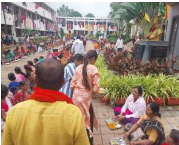
Serving the food to pilgrims