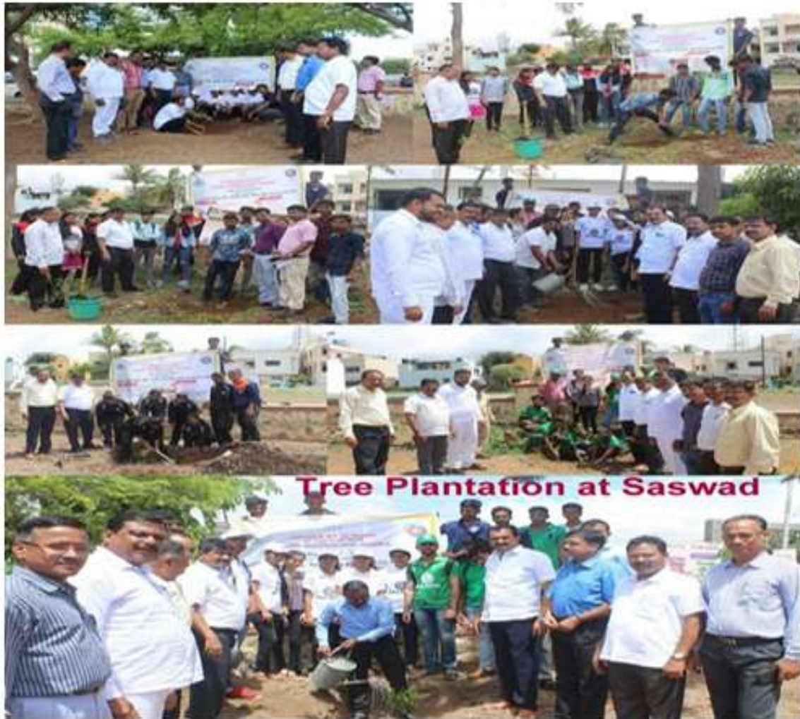
Green Wari-Plantation Activities during “Pandharichi Wari” (Dated June 27, 2019)

Hospital, Provincial Office, Market Yard, Taradatta East-West, Cemetery Road and Waghire College Campus.