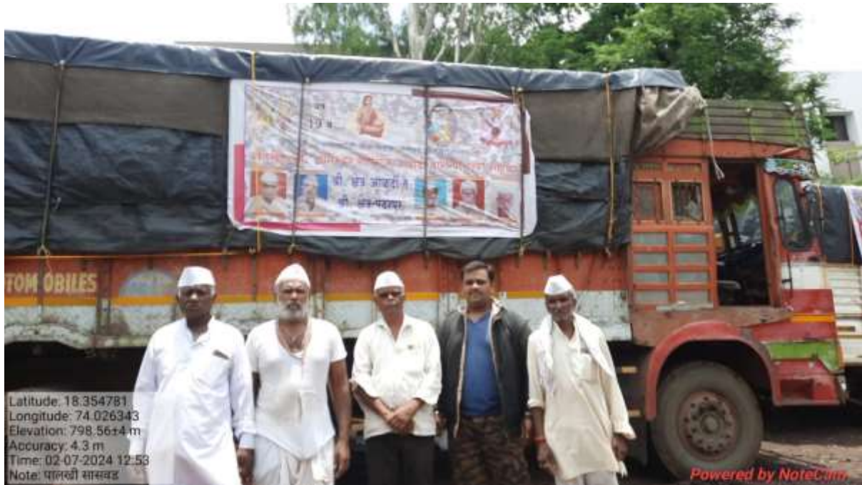
Faculty helping distribution of patravali (Leaf plates)