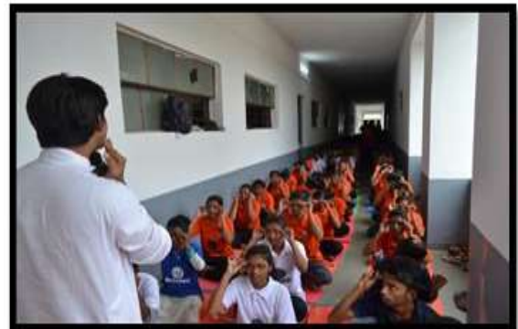
Yoga camp (Dated 28th and 29th June, 2019)