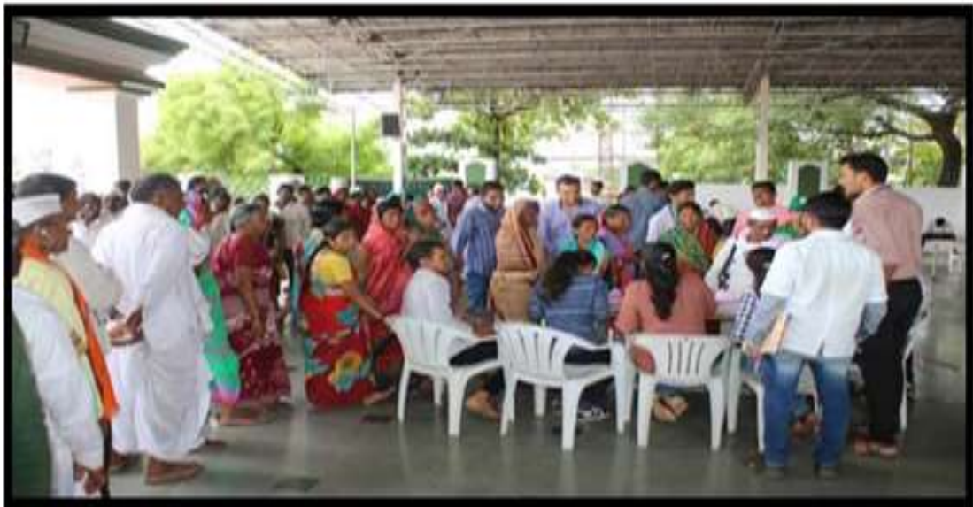
Swasth Wari-Health Camp (Dated 28th and 29th June, 2019)

Clean Wari - Cleaning of Saswad premises, distribution of free leaflets and collection of Ushtavali and Nirmalya (Dated June 28, 29, 30, 2019):