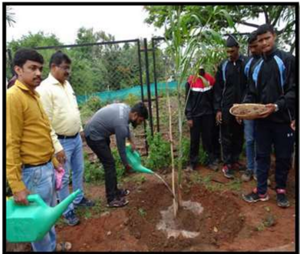
Tree Plantation Infront of Botanical Garden (30 th June 2019)