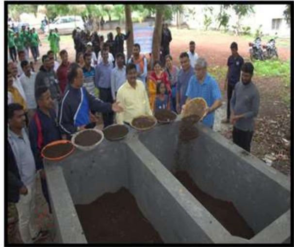
Compost Pit Inauguration (30 th June 2019)