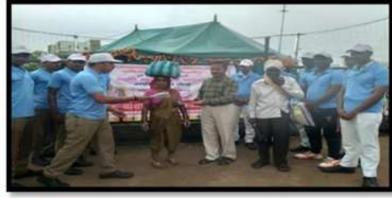
Jau devachiya gava